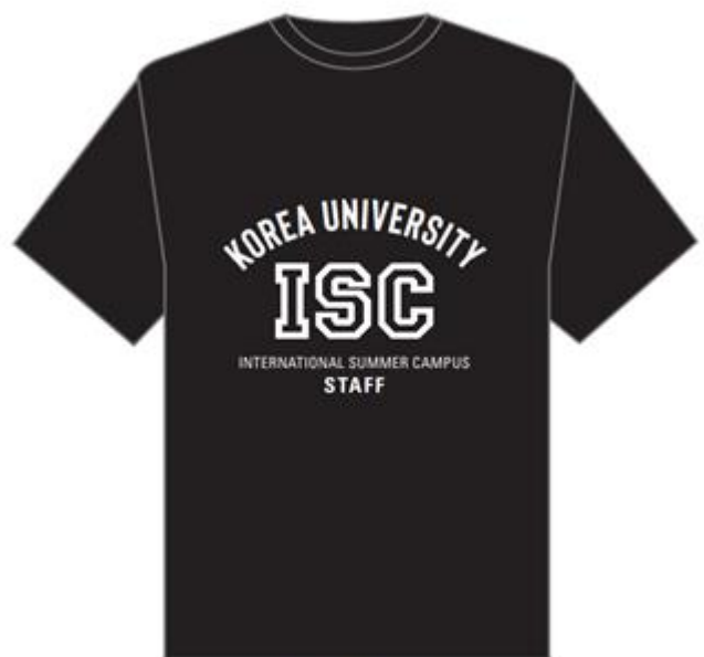
<ISC Staff Uniform>