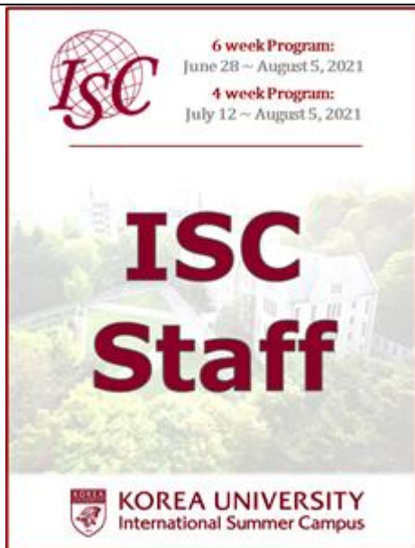
<ISC Staff Name Tag>